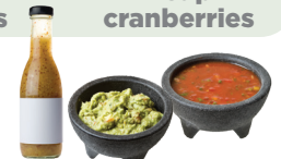
2 tablespoons guacamole, salsa, or dressing