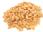
12 ounces beans