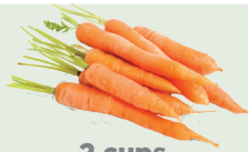
2 cups carrots