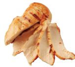
12 ounces chicken