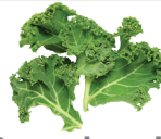
8 cups loosely packed kale